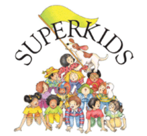
The Superkids will help us all to be great readers!

know them by memory!). Some of these will be taught within the Superkids text, but many will be learned through little readers that will go in your child's treasure box for continued practice. Memorization of these words will make 1st grade much easier!!