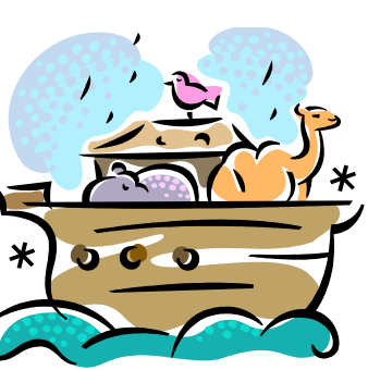
Noah, Noah! Brother Noah built the Ark!

In Religion, we have been learning all the good things that God gives us: welcomes, names, and stories. As part of our learning about the world around us, we will be listening to and reenacting the story of Noah's Ark! All children may bring a small stuffed animal to